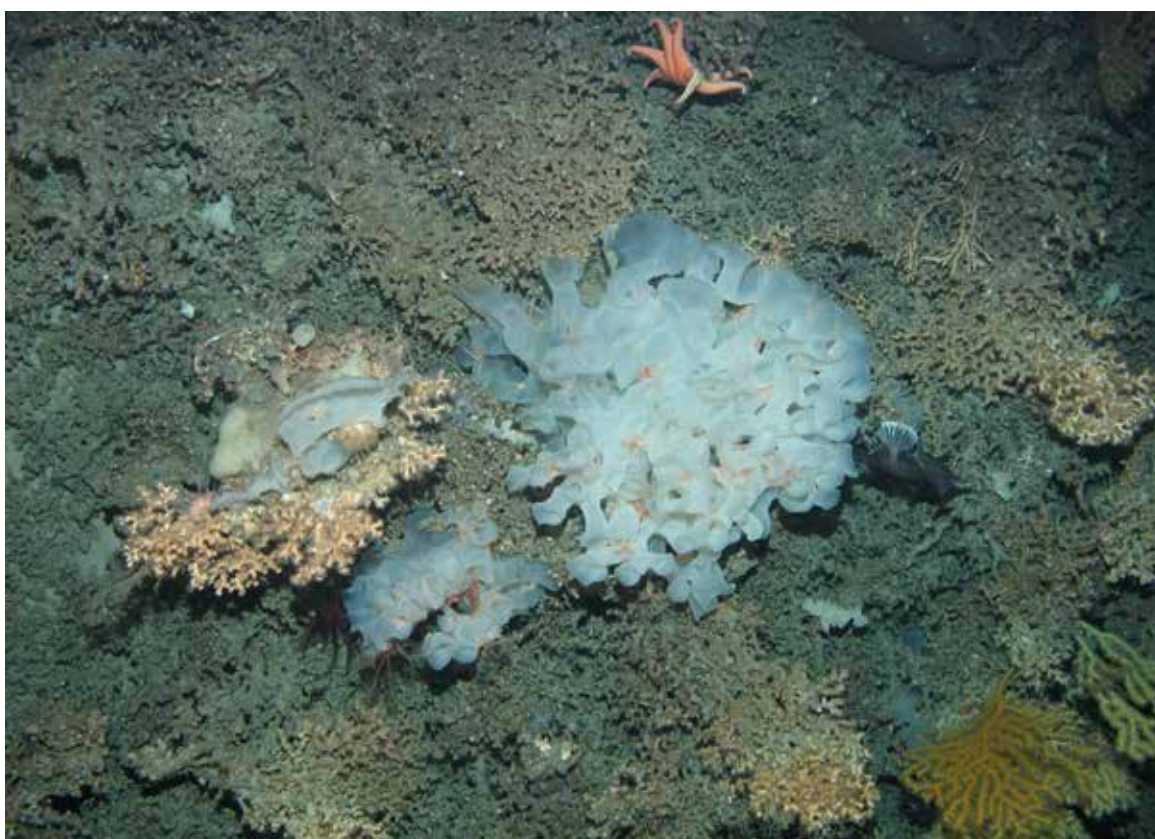
Underwater life at the Anton Dohrn seamount in the NE Atlantic ocean.