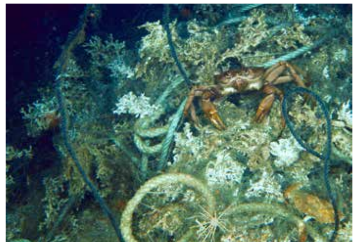
Ghost net off Ireland at 1000m depth.

Yet, even though these ecosystems are vitally important and there is clear evidence of the severe damage caused by deep-sea bottom trawling, UK researchers concluded that the deep-sea areas currently closed to bottom trawl fishing in UK waters together make-up only a fraction of the areas where vulnerable deep-sea ecosystems are likely to occur 10 .