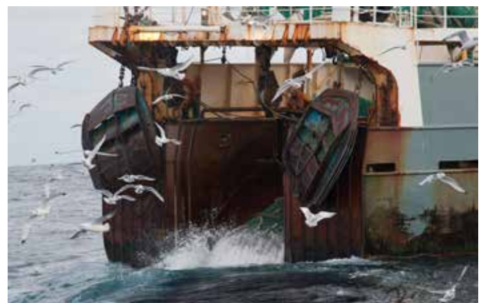
Spanish deep-sea bottom trawler Muxia fishing 170km off the coast of Ireland, in the NE Atlantic ocean.

A phase-out of deep-sea bottom trawling is a rational and eminently sensible step that would release EU fisheries and public finances from an economic and ecological drain.